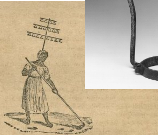
A WOMAN WITH IRON HORNS AND BELLS ON, TO KEEP HER FROM RUNNING AWAY.